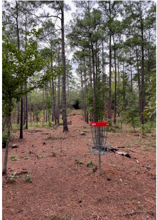
Course construction process