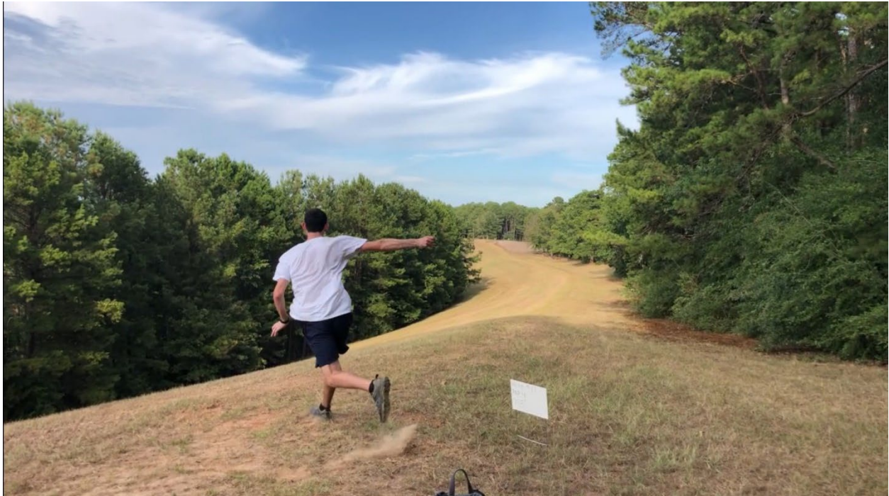
Site layout testing

This opportunity allowed both USACE and the partner to work together to complete a needed project for the community, as no championship level disc golf courses existed within a 2 hour drive. Working together continued the relationships and introduced new members to each other in a healthy, physical environment to accomplish a goal orientated mission.