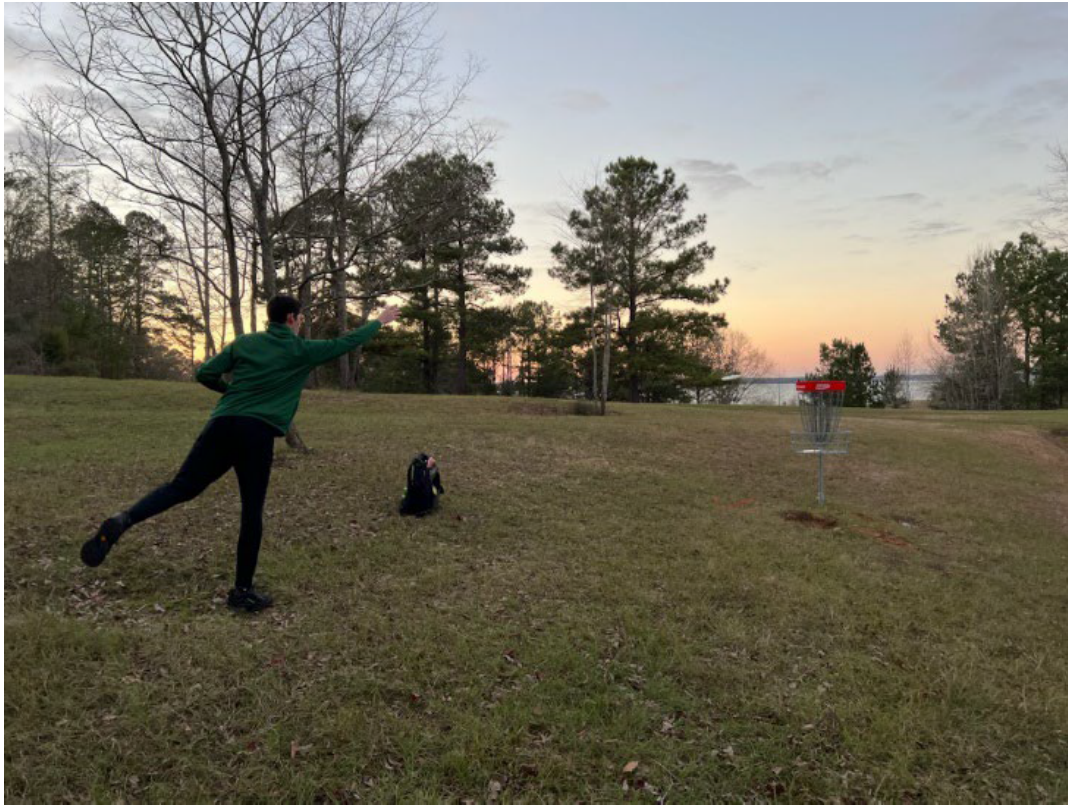
Late evening play