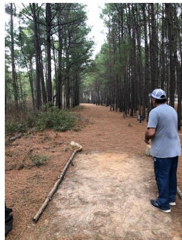
Hole 15, before and after

This disc golf course has already been rated as one of the top courses in Texas and the Arklatex area with the first fall tournament scheduled in October with 72 contestants signed up already. With the help of our partners, the community now has a top tier recreational opportunity that was lacking in the area. The course has already created a spike in visitation, with participants driving from three hours away to check out the new opportunity.