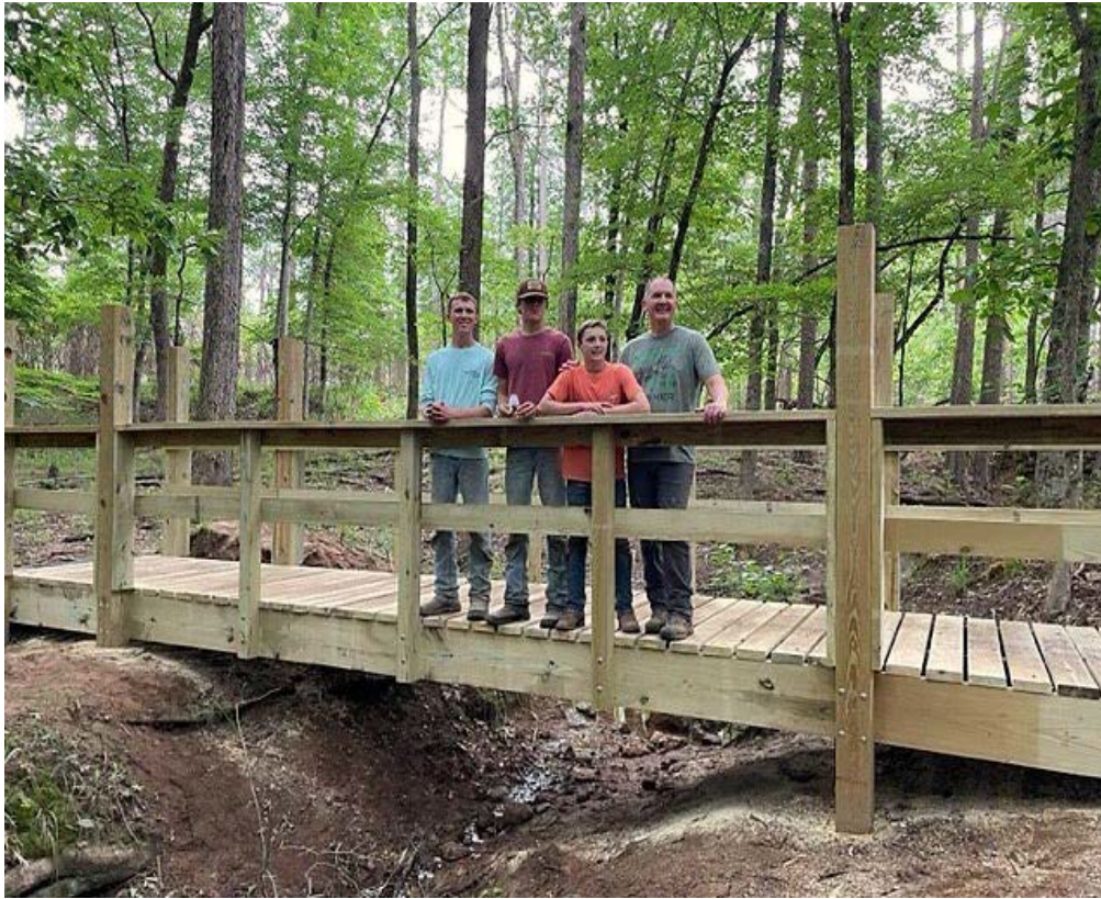
Eagle Scout foot bridge