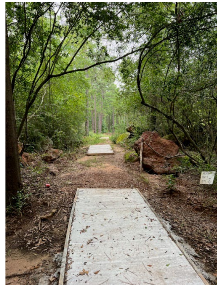
Hole 12, before and after