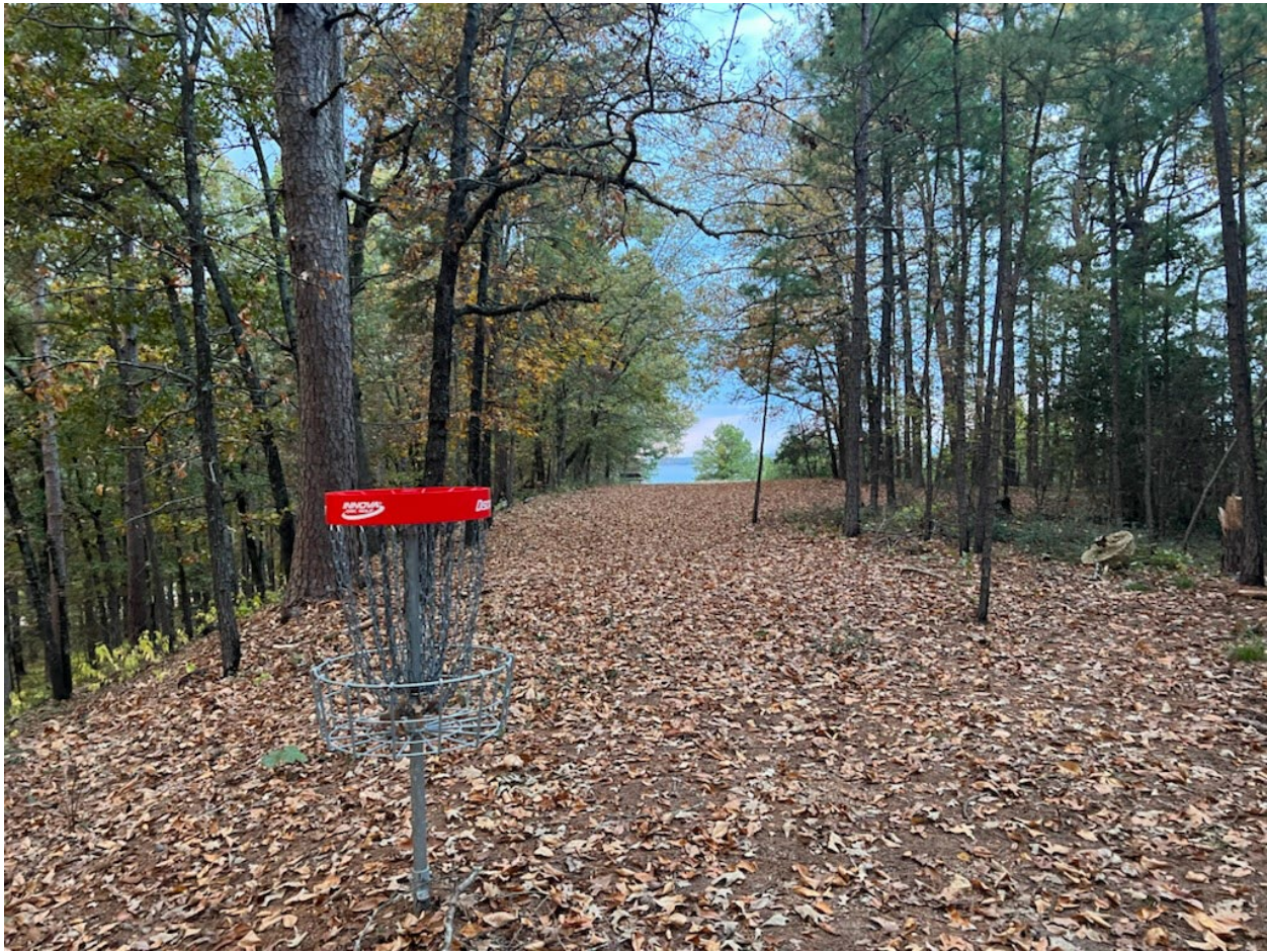
Hole # 16 on the edge of the levee

Wright Patman Lake and several partners have completed an 18 hole Disc Golf Course between Spillway Park and Piney Point Campground, strategically located near 3 campgrounds where travelers and locals can enjoy a challenging and fun outdoor experience in a sport that is growing exponentially every year. This course was previously 9 holes and orientated in the large open field known as Spillway Park. The old layout did not allow for much challenge or an outdoor feel that most disc golf enthusiasts look for. Installation was performed in conjunction with Texarkana Disc Golf Association, Holt Repair, Shreveport-Bossier Disc Golf Union, Lowes, Dynamic Discs NW Arkansas, Longview Disc Golf Association, Camden Disc Golf Association, Big Jakes BBQ, Turner Landscaping, and Troop 30 Eagle Scouts.