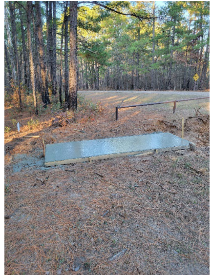
Concrete pad development